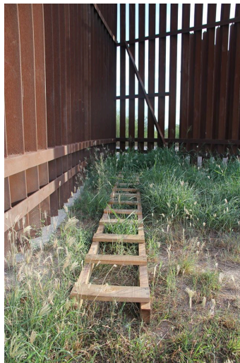
Figure 4: Ladder on the Border Wall in the Rio Grande Valley circa 2016